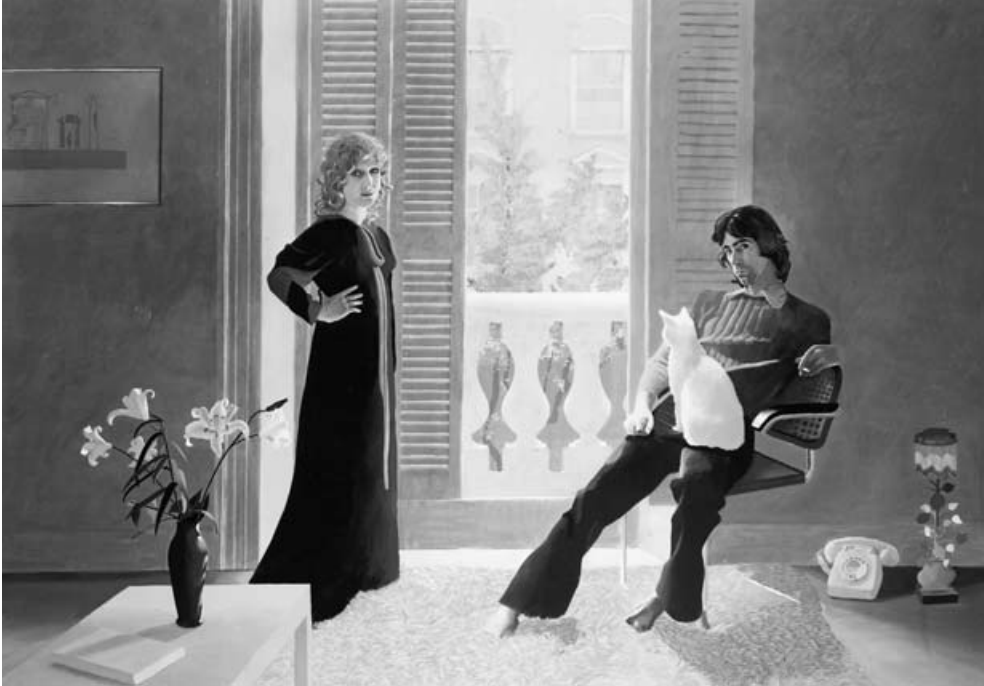
Mr and Mrs Clark and Percy by David Hockney, 1970

3 Complete the description with the present continuous form of suitable verbs. Use the negative where necessary.